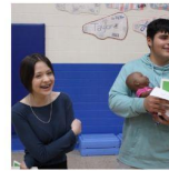
Collage Courtesy of Dara Gomez