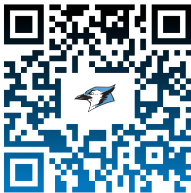
Scan the QR Code to watch the 2022 Spelling Bee.