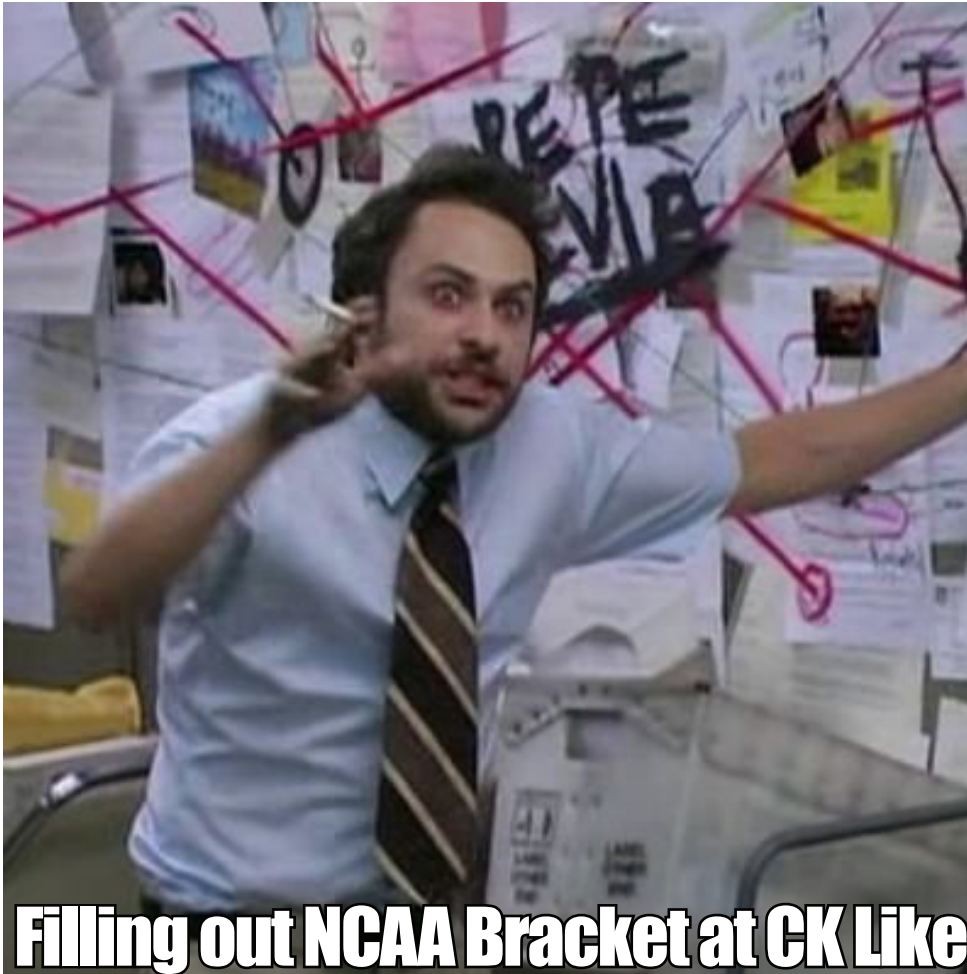
Filling out NCAA Bracket at CK Like