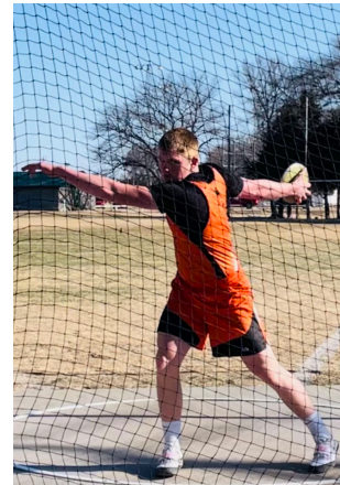
Naslund Finishes 3rd-place in Shot and Disc @Ainsworth Invite