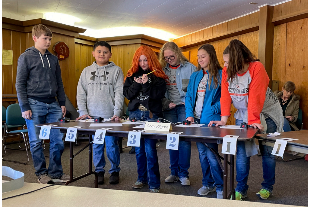
CK Junior High Quiz Bowl Participants (LtoR):

Varsity and Junior High Quiz Bowl teams compete at MNAC in Halsey.