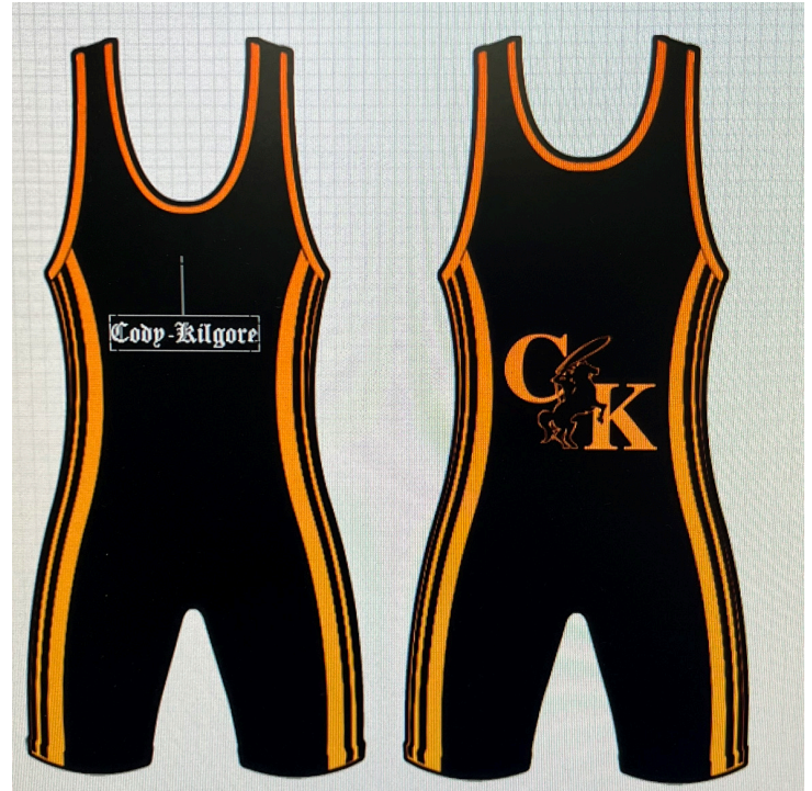
The CK Beat Staff designed a prototype singlet for a future CK wrestling team http://design.adidaswrestling.com/index.php/editor/index/id/19 .

in order to start one. The first thing we would need is a place to have practice and mats to practice on and host meets on. The next thing we need to find is people willing to coach a team. We would also have to talk to NSAA and see how soon we could get worked in the schedule. I have talked to people around the community and a lot of them have agreed that a wrestling team would benefit the school. I also know some kids that would come to Cody-Kilgore Unified Schools if we had wrestling. In order to get mats we could do fundraisers over the summer and raise money to purchase them. We would also need to purchase wrestling singlets. After we establish a team they could get together sometime during the weekend and design a singlet for the wrestling team to wear. One of the problems we will run into is also having a basketball team. Before we start a team we could send out a survey in the school which has students vote if they would do wrestling or basketball. We have also talked about that with students a little bit and based of of what they have said we would have enough for both but the survey would be good to make sure that it is true. We don't want to get rid of basketball because this town has a strong basketball community. It would also give students an alternative to do instead of having to do basketball every year.