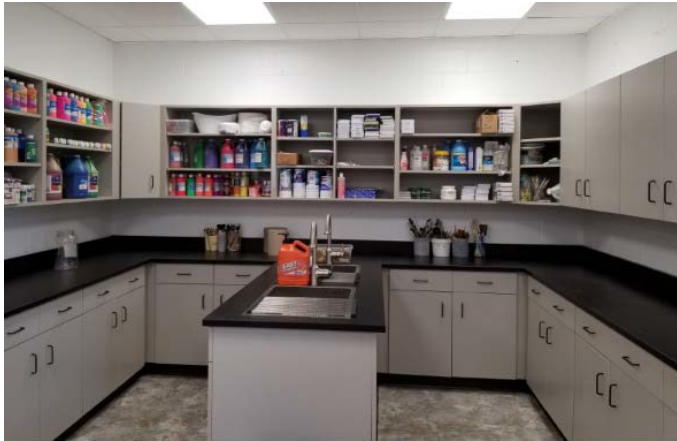
(Above) – the art room paint storage and sink area.

Again, a thank you to the community for approving our operational referendum in April 2017 that allows for us to include maintenance updates in our annual budget. In the past two summers we have updated the high school roof, art and agriculture classrooms, concession stand, and windows, while also getting new lockers, flooring, and siding at the elementary school. These projects are important to maintaining our buildings and keeping them viable for another 50 years.