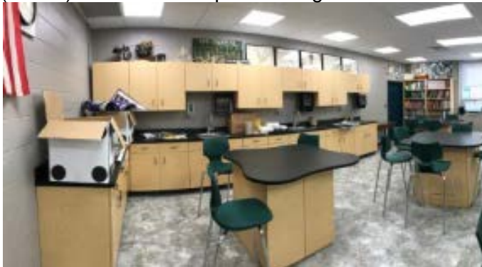
(Above) – A panorama of the Agriculture classroom cabinets, desks, and new tabletops for student workspaces.