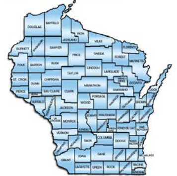
The Shared Resource project is a collaboration of many organizations across the State of Wisconsin who serve children and youth with special needs.

This "Snapshot" list does not display all available mental health resources. For a full set of resources for children and youth with special needs, click here