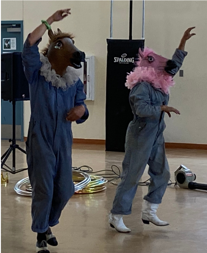
The circus came to Peñasco Elementary!