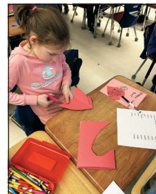
Students created many cards and notes to give to veterans.