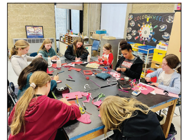
Members of the LIS student council creating Valentines in the LIS Art Room.