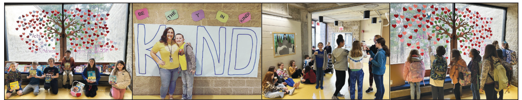
On "Cozy Up With Kindness Day" students and staff brought their favorite children's books to be donated.

Monday's theme was "Shine Bright With Kindness." The AOK students delivered hot chocolate to everyone in the morning. Tuesday's theme was "A Kind Heart Speaks Kind Words." Students and staff wore red, pink, or white. Paper hearts were hidden around the building for students to find. When they found a heart, they turned them in for a prize and received an inspirational sticker. The hearts were displayed on the Kindness Tree near the LIS main office. Wednesday's theme was "Team Up with Kindness." Students and staff wore team shirts and AOK decorated the mirrors in student bathrooms with inspirational messages. On Thursday, students and staff participated in "Cozy Up With Kindness Day." On this comfy day, students and staff brought their favorite children's books to be donated to the Greater Waterbury Interfaith Ministries Soup Kitchen and Family Shelter. Friday's theme was "Share the Spirit of Kindness." The LIS student council displayed a poster across from the Kindness Tree. It read "Be the I in Kindness." Kindness quotes were also read every morning with the morning announcements and have continued each morning since!