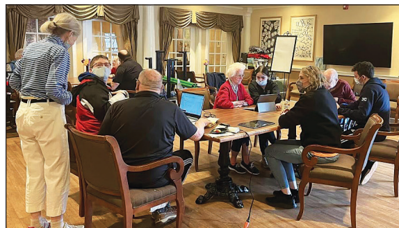
Students with residents enjoy working together on computers.