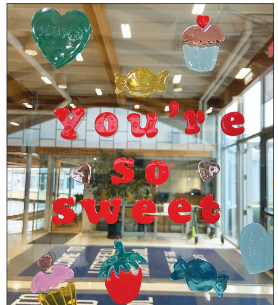
You're so sweet, decorations on the gym door as part of the afternoon of fun for LIS students.