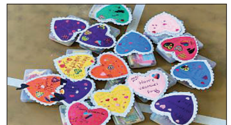
Beautifully created and heartfelt Valentine's cards created by Third Graders!