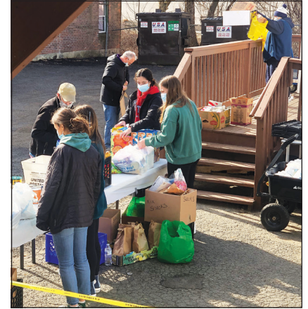
Members of Interact club sorting food items for distribution to local families.