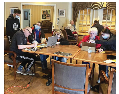
Residents appreciate the time and support offered by students.