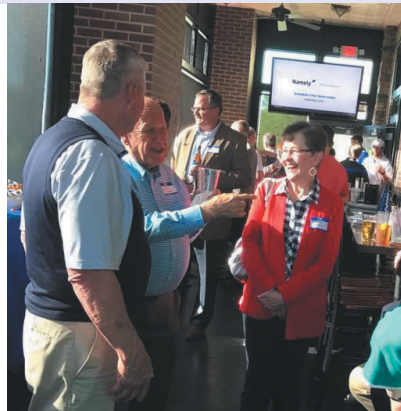
◀ SMC alumni reminisce at the Panther Pride gathering in Kansas City this spring.