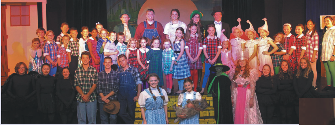
▲ The cast and crew of the 2017 spring performance of the Wizard of Oz dazzled audiences at four sold out shows, reminding us all that there is truly "no place like home!" ►