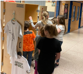
Student Council members organizing products for the School Store at CRES.

The CRES Student Council is heading up the operations of the storefront. They are learning about entrepreneurship and customer service through this hands on experience. These students are working collaboratively with the tech & innovation students to make this venture a success!