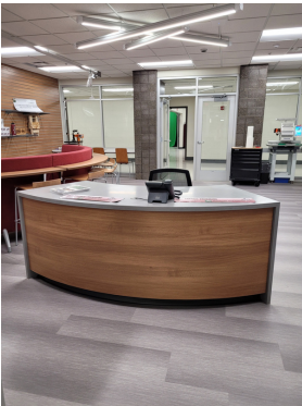
Flexible learning space & Ranger Made storefront.

Ranger Made is a new $3.6 million state-of-the-art student managed manufacturing company located inside Crosby-Ironton High School that was built and equipped as part of the 2019 Bond Referendum. In this program students design, create, manufacture, and sell various products. The facility includes wood and metal fabrication manufacturing spaces, automotive care and small engines facility, computer automated drafting and design room, a technology and innovation lab that