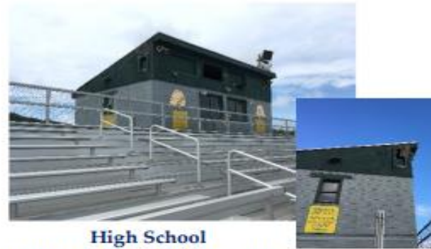
High School Upgrade Press Box Systems Add new Upper Level