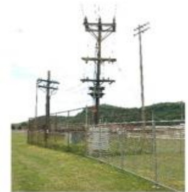
Middle School Remove High Voltage Yard