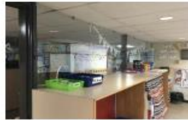
AWB/PBC Elementary Corridor Wall Infill