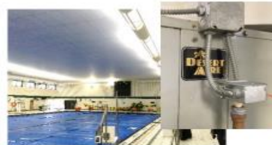
High School Replace Pool Air Handler