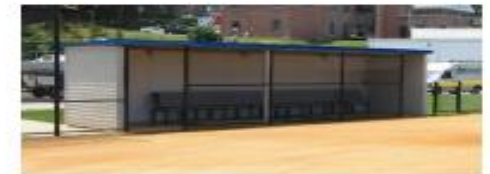
PBC Elementary New Dugouts and Fencing