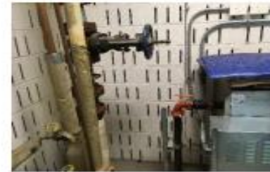
Middle School Add Code Required Back Flow Preventor on Water Service