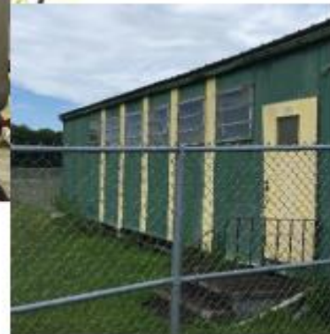
High School Demolish Old Concession Stand