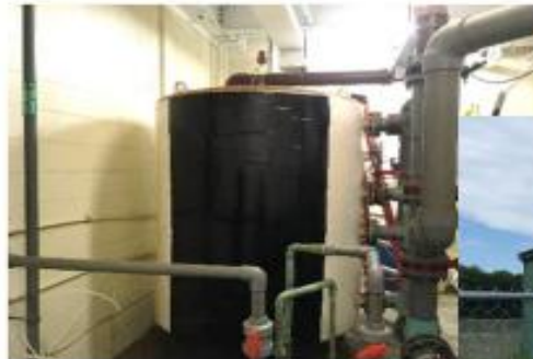
High School Replace Failing Pool Filtration System