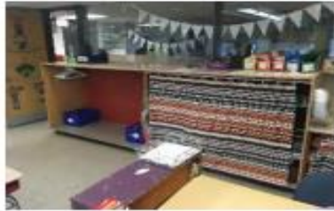
AWB/PBC Elementary Remove Asbestos Floor Tile Replace Old Unit Ventilators