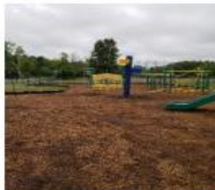
PBC Elementary Improve Drainage at Playground