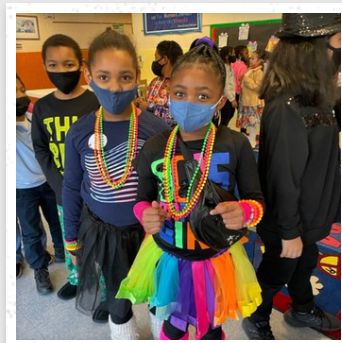
OUR STUDENTS LOOK FABULOUS!