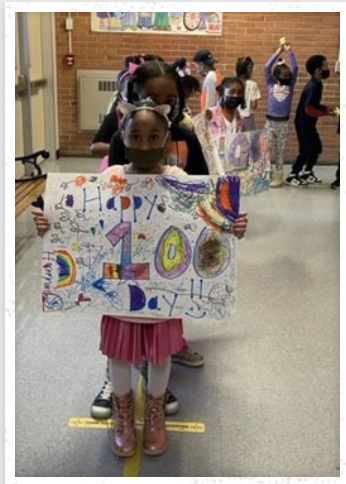
100TH DAY PARADE