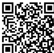
Book Fair Site