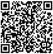
Book Fair Flyer