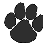
Stuarts Draft Middle School COUGARS