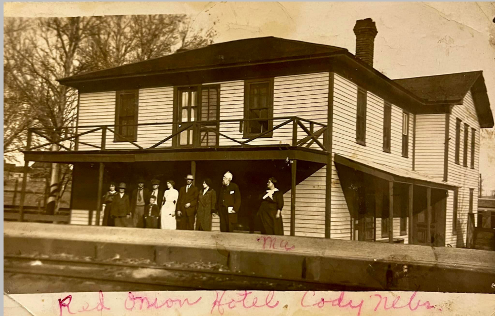
An undated photo depicts The Red Onion Hotel in Cody in its heyday prior to its ultimate demise as a victim of alleged arson. -

For a few days past the hotel had been used only as a rooming house, Al. Smith and George Stotts having charge of it. There were not many people in the building at the time of the fire and as the fire started on the north side of the roof the occupants