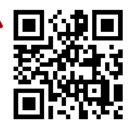
Scan with your phone for more information