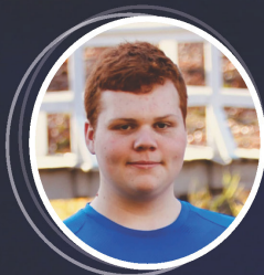
Gordon Martin College/ Chemical Engineering