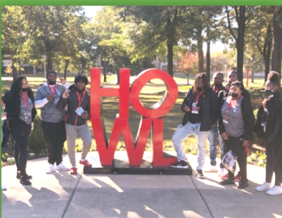
Arkansas State University visit