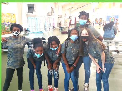
Rec Time Hangout