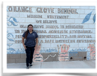
OGS Teacher of the year