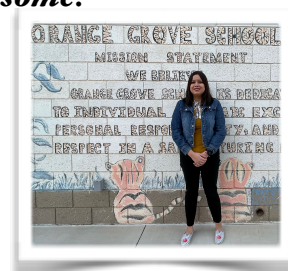
OGS New teacher of the year