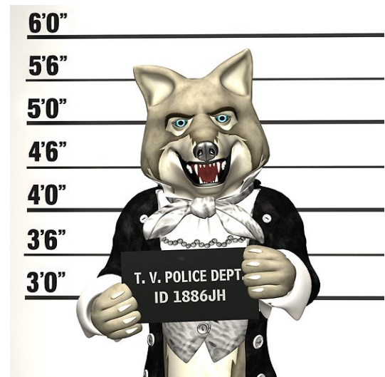
Wolf, Big Bad

The musical will be presented for your musical enjoyment, as we tackle the age-old question of why the old wolf is so bad.