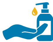
Hand hygiene and coughing/sneezing etiquette