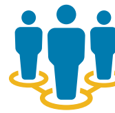
Evaluate large gatherings outside of classroom/core groups