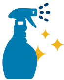
Cleaning and disinfecting