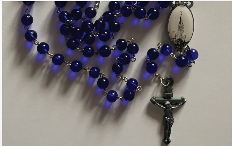
Rosaries are available to purchase at the St. Mary's Religious Gift Store.