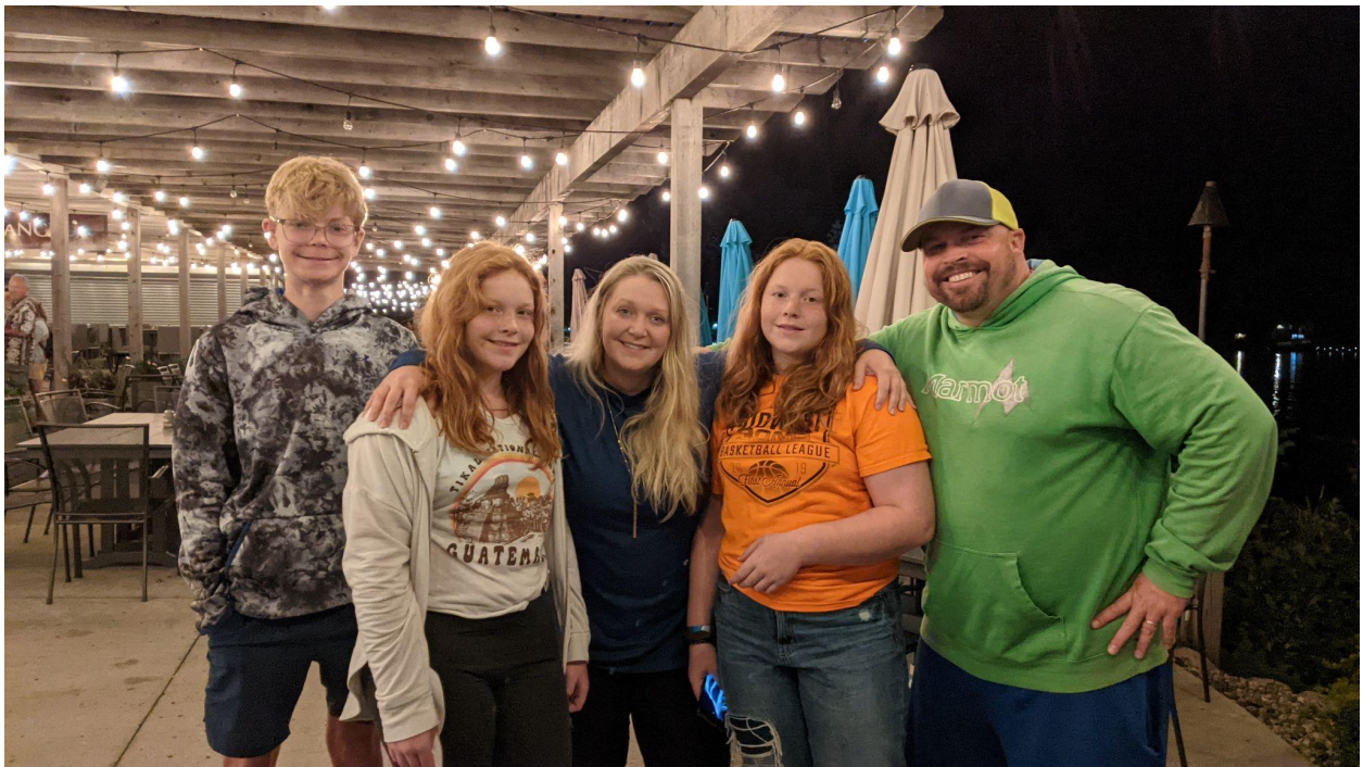
Last summer, Lake Okoboji, Iowa

I honestly don't have a new year's resolution.