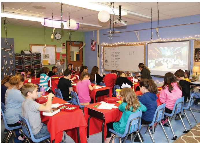
Café 148 day

Students will become inference detectives by reading, thinking and writing inferences based on their background knowledge, new text information, and personal experiences.