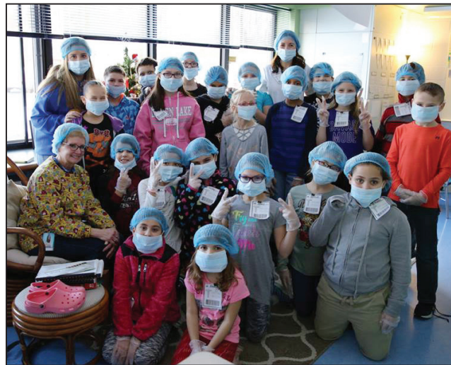
Surgery Center day

The second transformation was a Surgery Center day. The theming of the day started with the front door that read "STOP SURGEONS ONLY BEHIND THIS POINT" and "STERILE ENVIRONMENT INSIDE". As soon as students entered the room they were greeted by the sound of a heartbeat pumping through the classroom