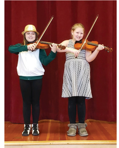
Denti students playing their violas, made possible thanks to the Rome Community Foundation.