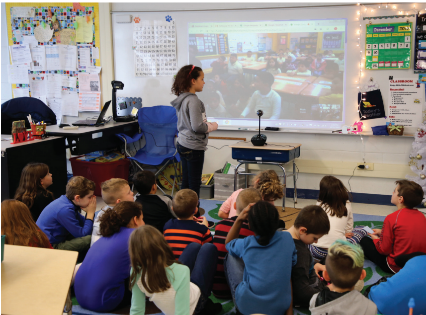
Ridge Mills second graders skype with students in Brooklyn.

students insights into the publishing process. She also shared a glimpse out her window into the sunny and 75-degree Arizona weather. Rome students reciprocated by sharing the snowy view from the library windows! And, best of all...students learned that the sequel to "Insignificant Events in the Life of a Cactus" is in the works and will be published in September of 2019.