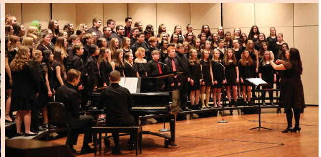
RFA Mixed Choir