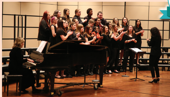
RFA Academy Singers