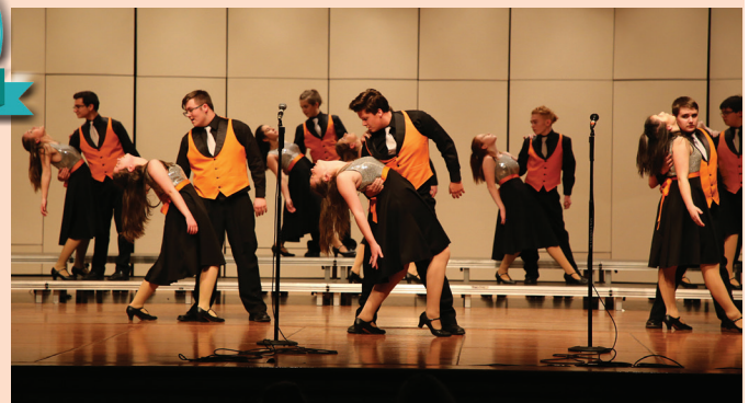
RFA Rhapsody Show Choir