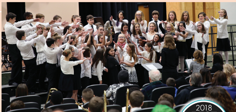
Ridge Mills Winter Concert