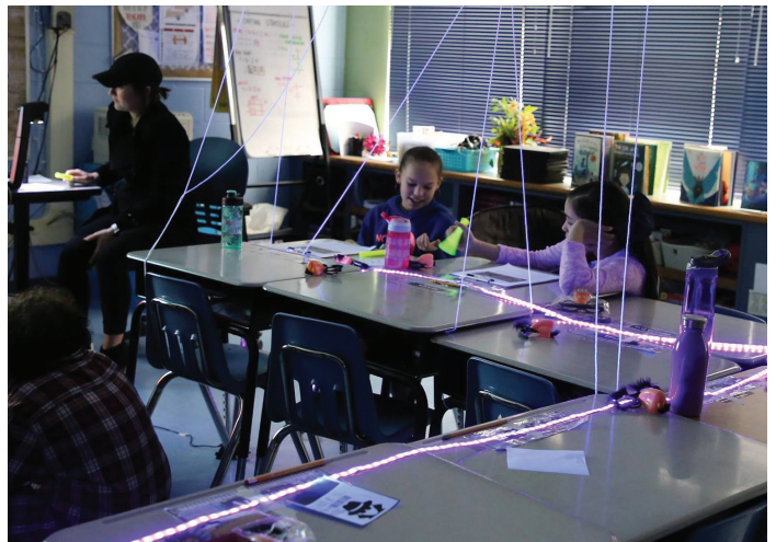
Spy Lab day