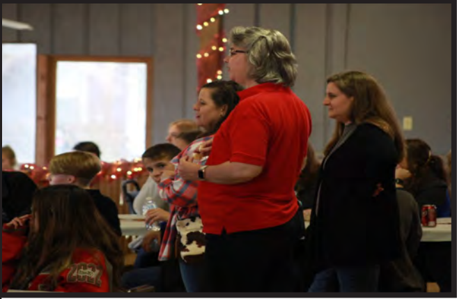
RHS/CHS FBLA Advisers Answer Questions