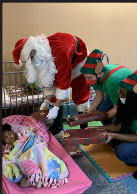
Autumn gets a personal visit from Santa!