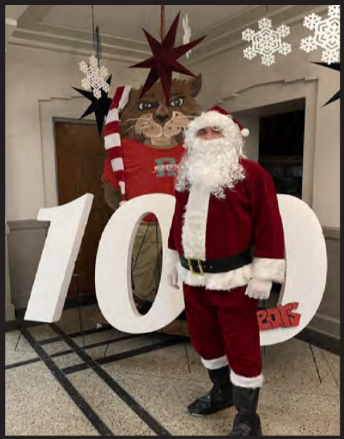
Danta pays tribute to 100 years of RHS!

Just as quickly as Danta arrived, he left to carry on other job related duties as assigned. As a 12 month employee, Father Time just cannot afford to let Danta chill out too long and his holiday time is obviously not allowed during the Christmas season. As Danta is a busy man this time of year, and we all know how the elves can manage to find ways to somehow get out of hand when he’s not around, he left with a found farewell for Bearcat Nation and went back to work bringing joy to others.