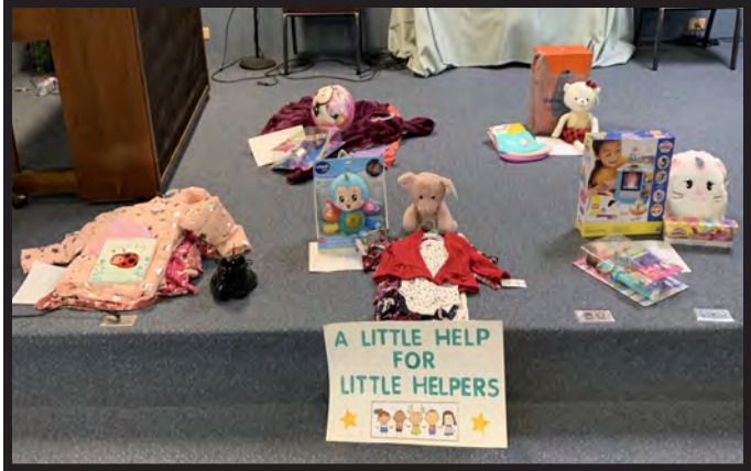
Only a few to go - they can't wait to be loved!