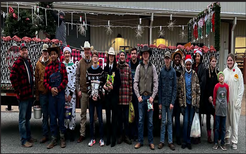
RHS FFA members proudly pose in front of their float after hours of hard work before the Ruston Christmas Parade, where they would capture 3rd place in the decorations contest.