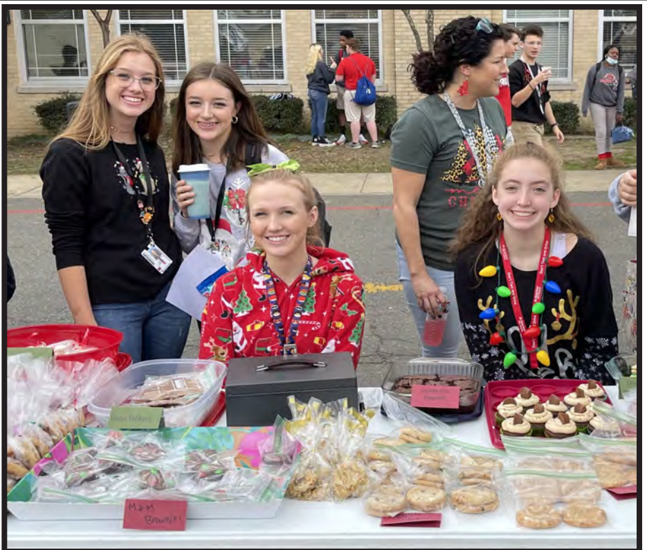
Talented Art students showed their talents in baking and decorating at the Talented Art Bake Sale held at RHS on December 17, 2021.