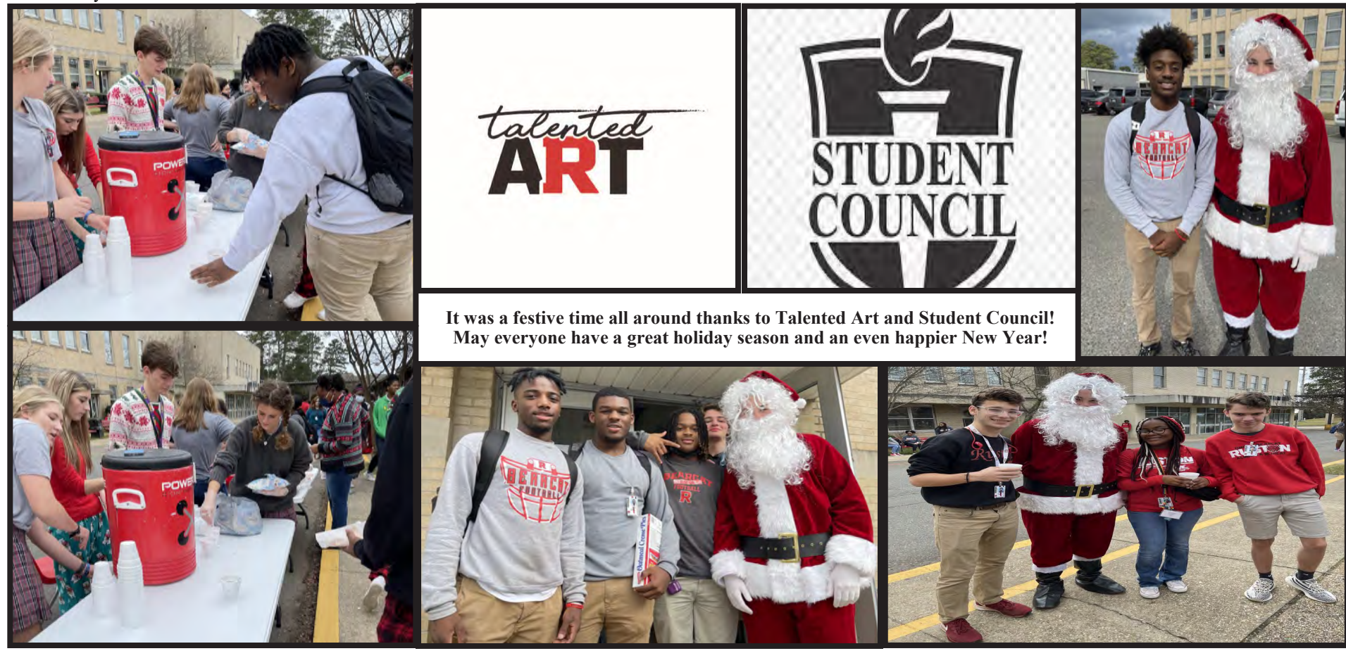
It was a festive time all around thanks to Talented Art and Student Council! May everyone have a great holiday season and an even happier New Year!