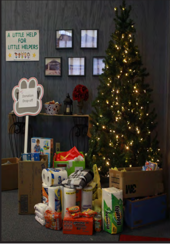
"A Little Help for Little Helpers" Donations Under the Christmas Tree