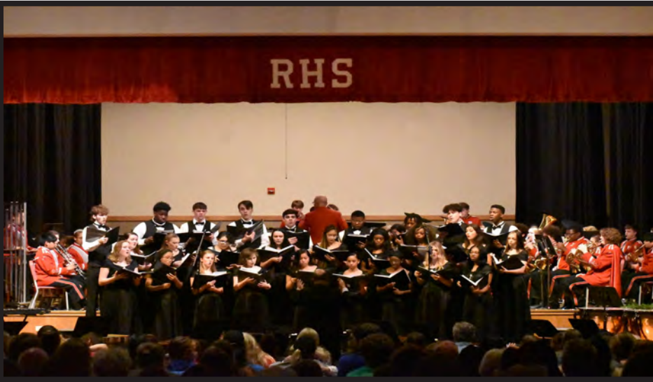
Above: The Ruston High School choir and band perform the Holiday Concert together on December 16, 2021.