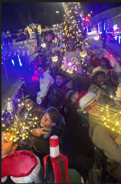
RHS FFA members having fun at the Ruston Christmas Parade.