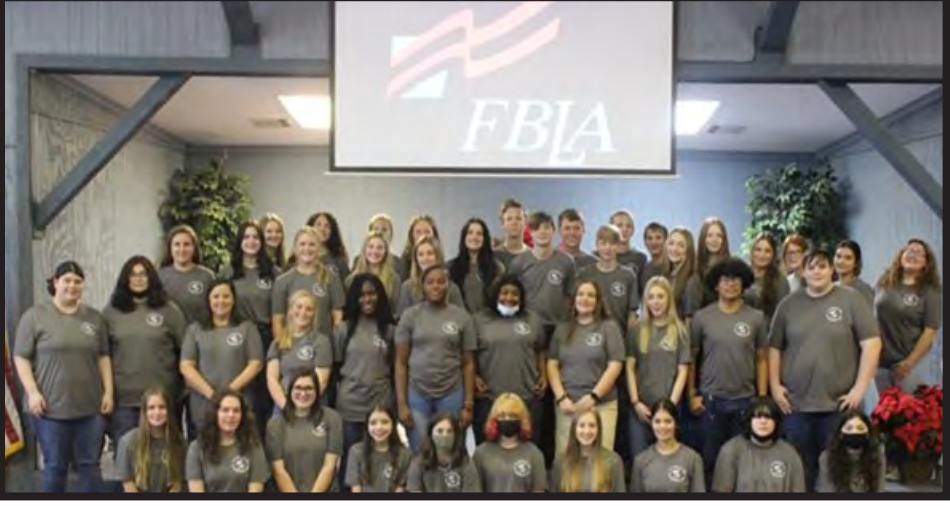
Choudrant FBLA Members Attending the Retreat