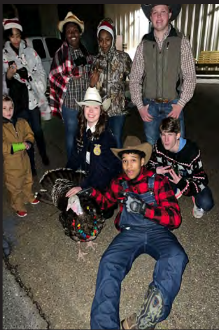
RHS FFA prepare to load, turkey and all, for the Christmas Parade.