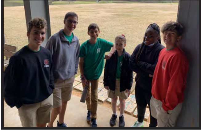
RJHS ML FBLA Members Attending the Retreat