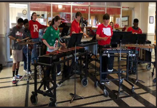
Below: The Ruston High School band continues the tradition of welcoming students and staff on the last day before Christmas break!