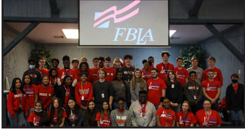
Ruston High School FBLA Members Attending the Retreat