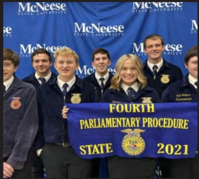
RHS FFA Team Event, 4th Place Parliamentary Law