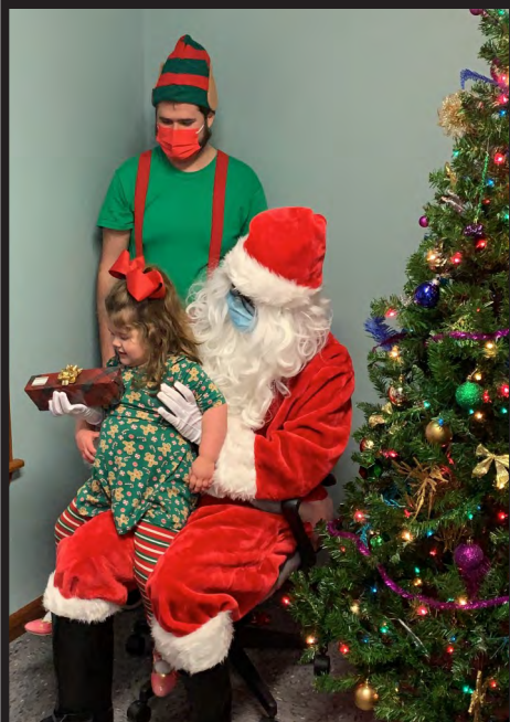
Lily loved the attention and visit!