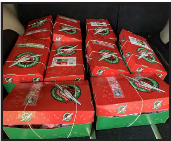
Shoeboxes prepared by Keywanettes are filled and ready to ship to Operation Christmas Child.

After completing their shopping, the Keywanettes filled the boxes to send to Operation Christmas Child through the Samaritan’s Purse organization. The organization will now deliver these boxes to children all over the world! The Keywanettes are happy to be able to do their part and give and hope that their gifts bring joy and happiness to a child somewhere around the world.