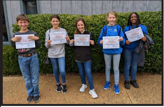
I.A. Lewis ML FBLA Members Attending the Retreat