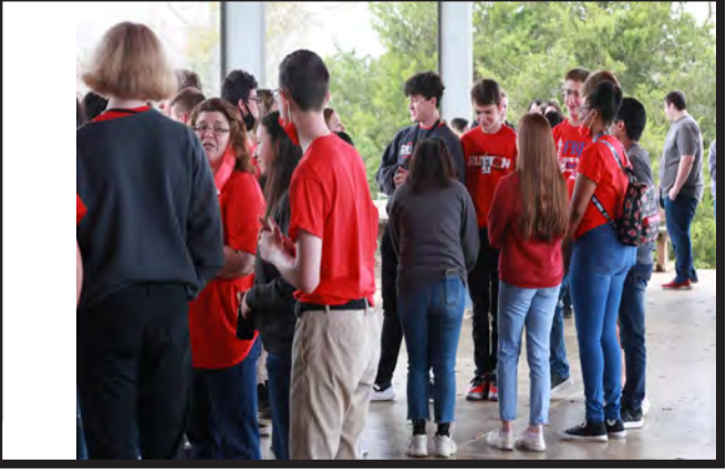
RHS/CHS FBLA Members in a Break-Out Session