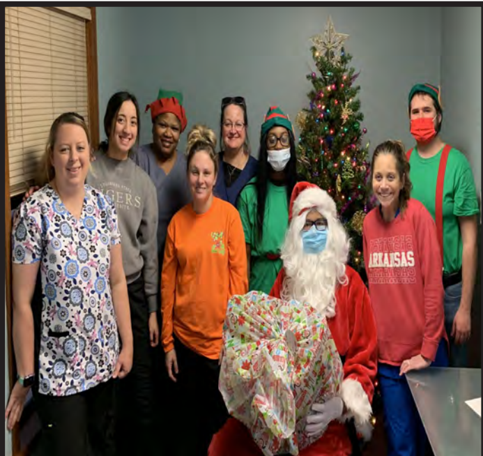
The super staff of Little Helpers also visited with Santa Claus.