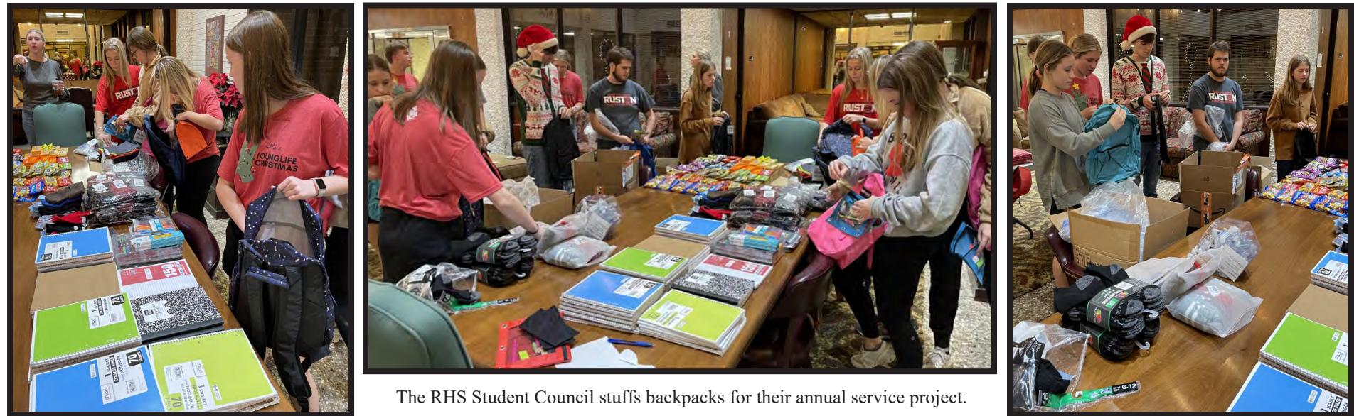
The RHS Student Council stuffs backpacks for their annual service project.

Student Council held its annual Christmas party and annual holiday service project on Wednesday, December 15, 2021, at the Young Life Bank. Members in attendance ate snacks and played a Dirty Santa gift card exchange game. Then they completed their backpack stuffing service project. The backpack stuffing service project is sponsored each year at Ruston High by the Student Council. Various clubs and organizations are invited to sponsor backpacks that are filled with school supplies, sweatshirts, socks, candy, and electronic accessories among other necessities. Student Council stuffs the backpacks at the Christmas party before they are given out to students. Student Council would like to thank the following organizations for their support in helping to sponsor the backpacks this year: Keywanettes, the cross-country team, powerlifting, FFA, speech and debate, National Honor Society, the football team, and FCA. We couldn't do it without you!