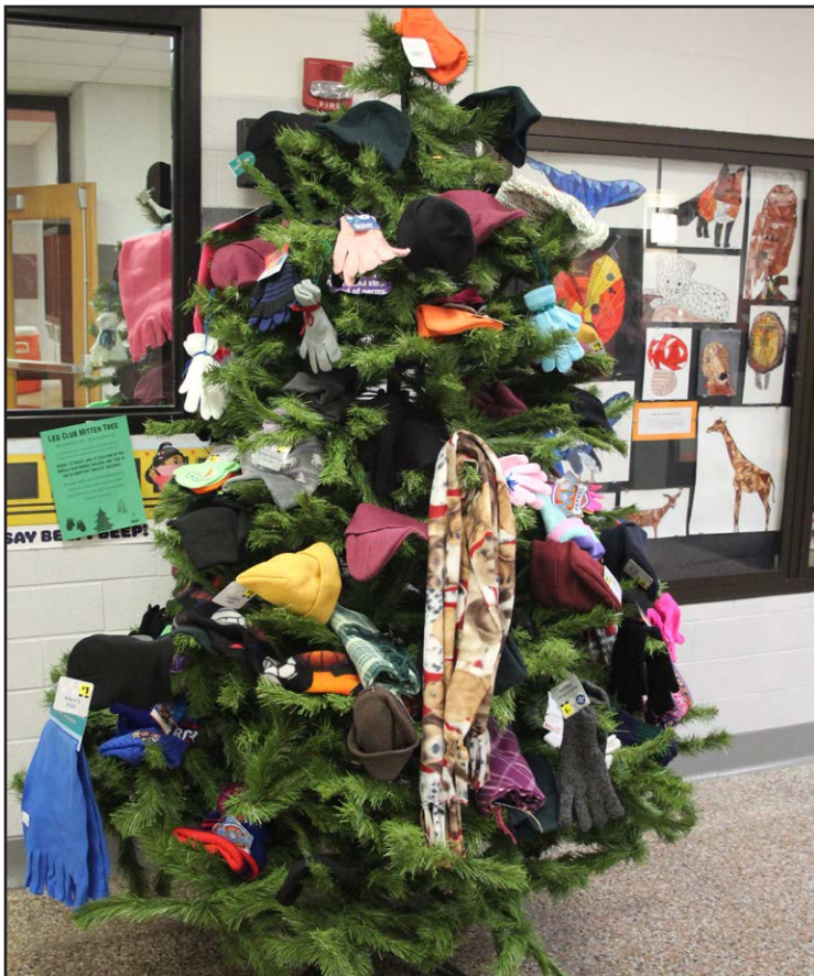
Our Leo Club mitten tree project was a tremendous success! Thank you to our generous school community for your support.

The Board will continue with its search for a superintendent for the district. Please check the district's website for additional information and updates.