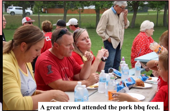
A great crowd attended the pork bbq feed.