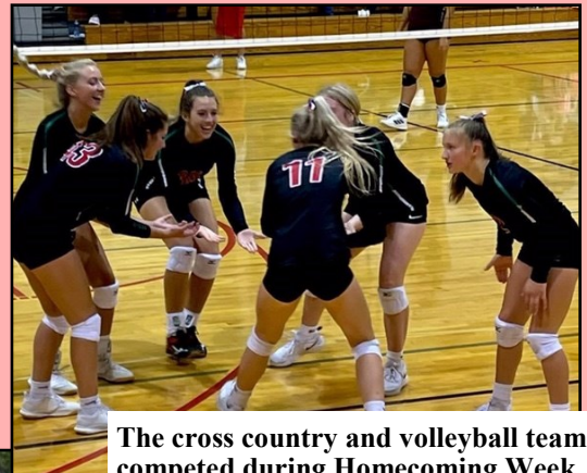
The cross country and volleyball teams also competed during Homecoming Week.