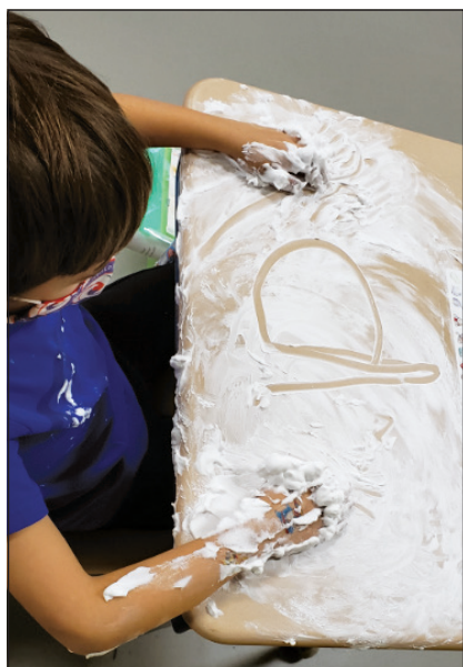
Learning how to write our letters - in shaving cream!

During the 2019-2020 school year, a committee of teachers and administration met regularly to review and research available phonics programs. The previously utilized program had been in place for many years. Periodically, it is important to review curriculum and programs to determine their effectiveness. We researched 3 different programs Units of Study in Phonics by Teachers College, Reach by National Geographic and Foundations by Wilson.