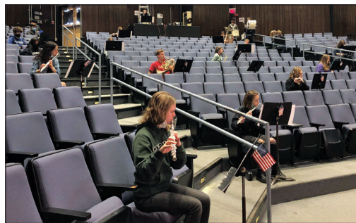
LHS Band Rehearses for Veterans Day.