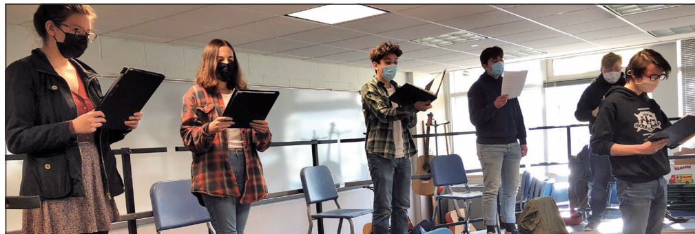
Chorus Rehearses for Veterans Day.