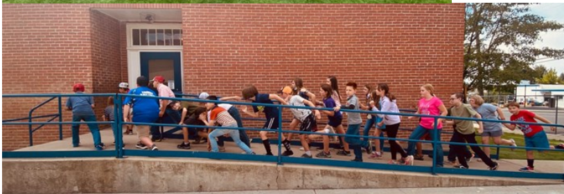
4th and 5th Grade: Running a marathon this school year.