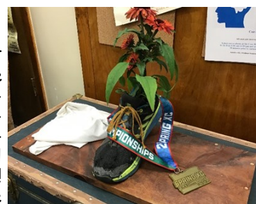
Student Artifact Sample from ENG I/II