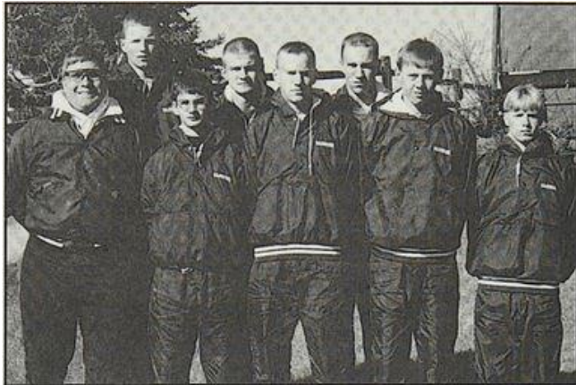
1A — Calamus-Wheatland

In the summer and early fall of 1996 there were some major sporting events taking place in the United States. In July, the summer Olympic games started in Atlanta, Georgia; in August, the Big XII conference was officially inaugurated with a football game; in September the U.S. won the inaugural 1996 World Cup of Hockey by defeating Canada; and in October the Warrior cross country squad became the first team in school history to capture a team title.