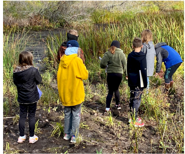
Students explored Leo's Landing to study invasive plants