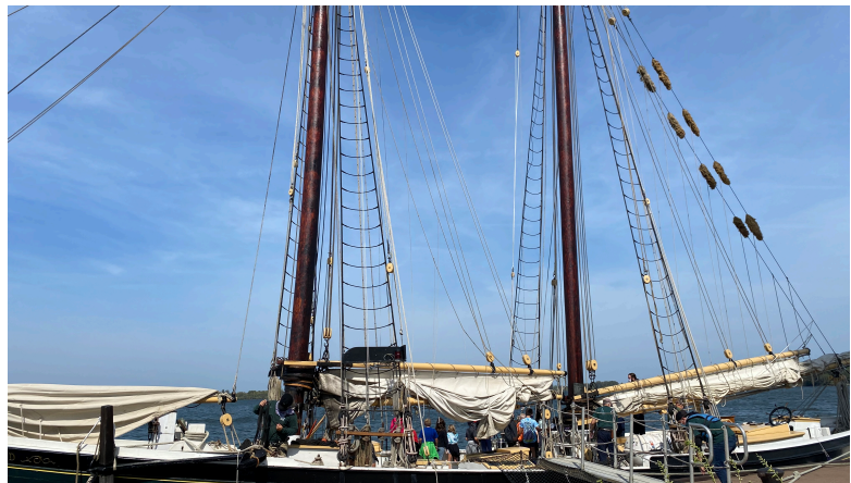
IES Students enjoyed a day on Lake Erie sailing on the Lettie

On September 27, the Iroquois Elementary gifted class visited the Erie Maritime Center, embarked on several hands-on activities with the Maritime Crew, and set sail on the Lettie. G. Howard. Students spent the day learning about the unique history of Lake Erie and the War of 1812. Students learned about rope tying and the importance of understanding the various holds. In addition, students learned about weather and the role it plays when sailing. To conclude the day, students set sail on the Lettie. G Howard where they learned about the day-to-day operations on the historic ship.