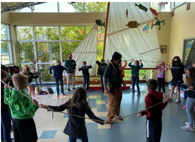
Students learned about the importance of rope typing while sailing Gifted News

More from the Erie Maritime Museum- September 27, 2021: