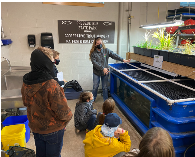
Students learned about fish management on Presque Isle