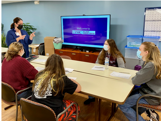
Iroquois High School Students visited UPMC Hillman Cancer Center to learn about career opportunities

medical pathway. Students enjoyed a fun-filled day that included a tour of the facility, meetings with various career professionals and an inside look into the health/ medical pathway. Students completed an information finder activity that included important facts about the Cancer Center, the various types of jobs available and the role that each career professional plays in providing the best possible patient care. What a great experience for the students, especially those interested in a health/medical career!