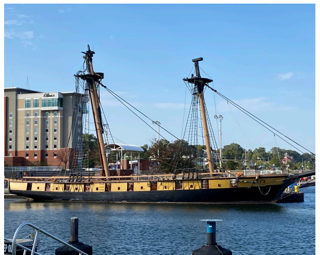
Students learned about the Battle of Lake Erie and the War of 1812