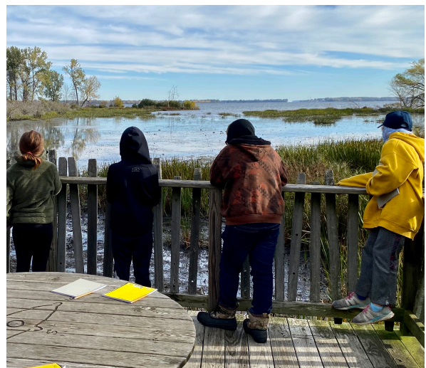
Students observed wildlife at Leo's Landing on Presque Isle