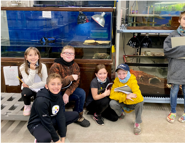
IES students visited the aquatics lab at the RSC