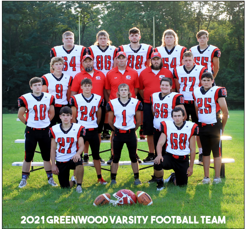
2021 GREENWOOD VARSITY FOOTBALL TEAM