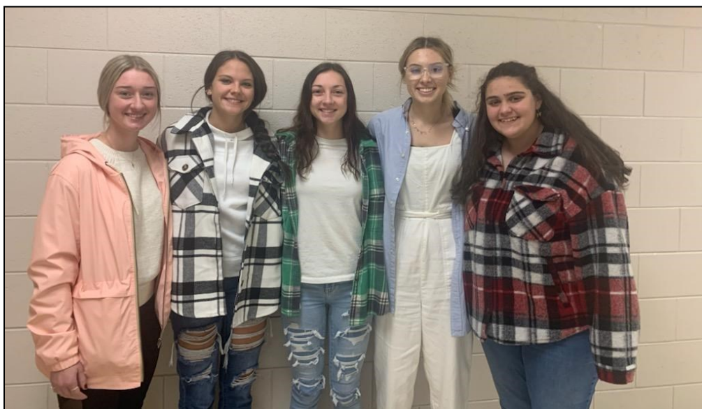
ALL CONFERENCE CHOIR MEMBERS