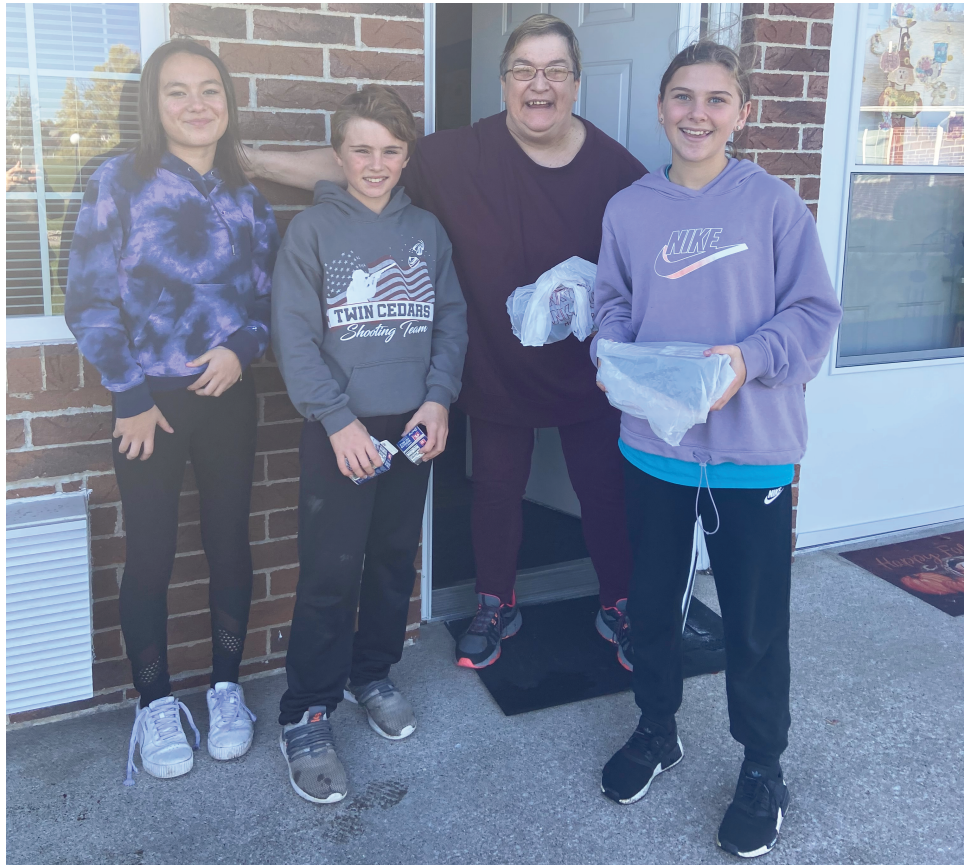
Elementary Student Council delivered Meals on Wheels to Knoxville Senior Citizens the week of November 8.