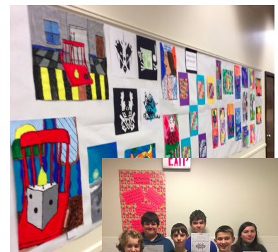
honorable the American