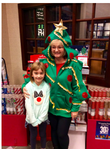
A photo of the winners and mentions for the Daughter of