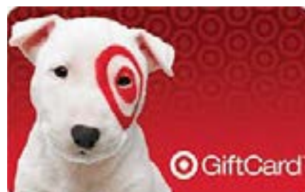
$200 Target Gift Card