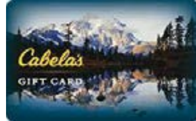
$600 Cabela's Gift Card