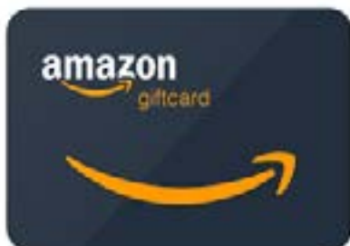
$300 Amazon Gift Card