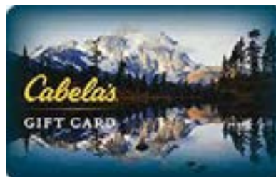
$500 Cabela's Gift Card