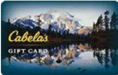
$1000 Cabela's Gift Card