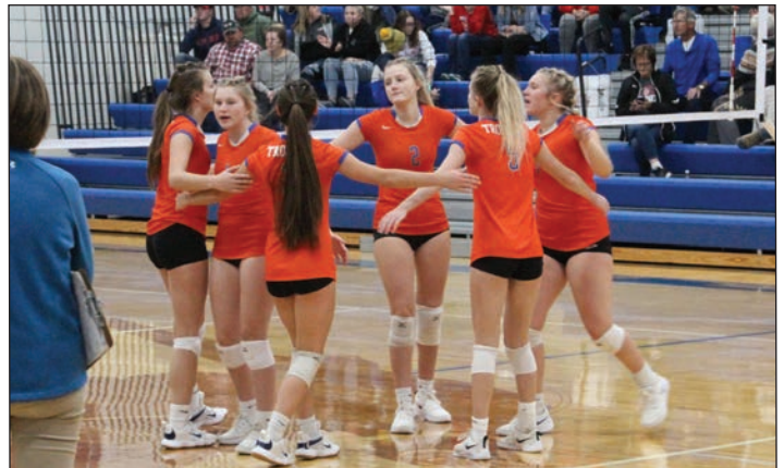
The girls come together to celebrate a score!

Dig Pink night was October 12, against the Wagner Red Raiders. Every year the two teams schedule their game in October for Breast Cancer Awareness Month so that they can team up and do the Dig Pink and donate to Breast Cancer Research. The Trojans took Wagner to four sets, but fell short on the win. A new tradition was set this year. At the end of every Dig Pink game between Parkston and Wagner, the winning team will get to