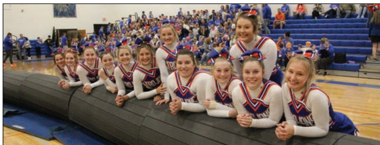
Top: The faculty face off with the royal court in a volleyball game. Above: The Competitive Cheer Team prepares to perform for the crowd at the Homecoming pep rally.