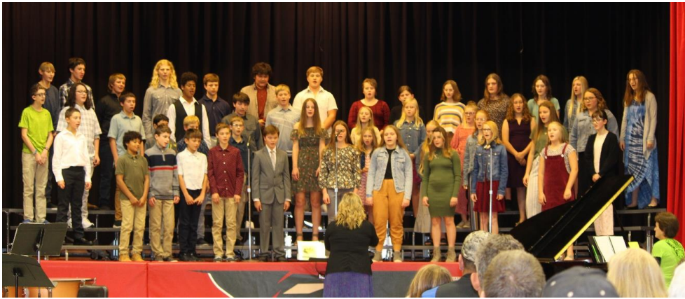
Avon junior high choir performed at the Fall Concert on November 8.