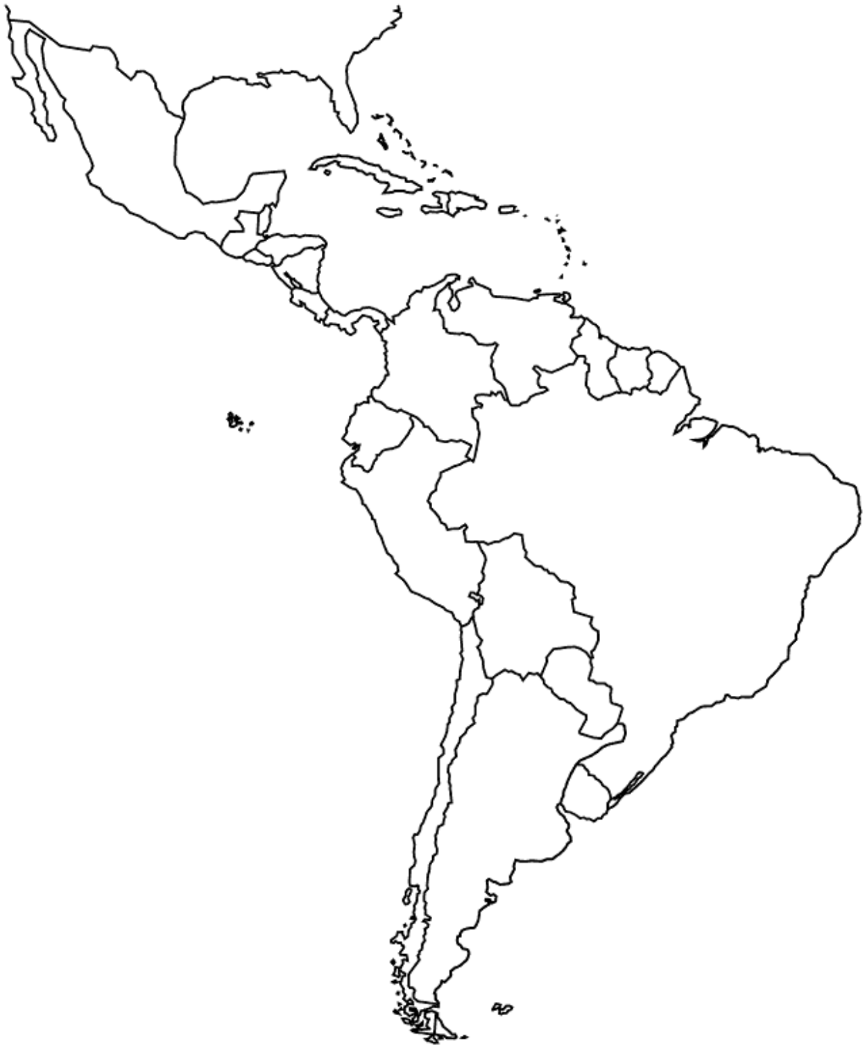
COUNTRY MAP #2