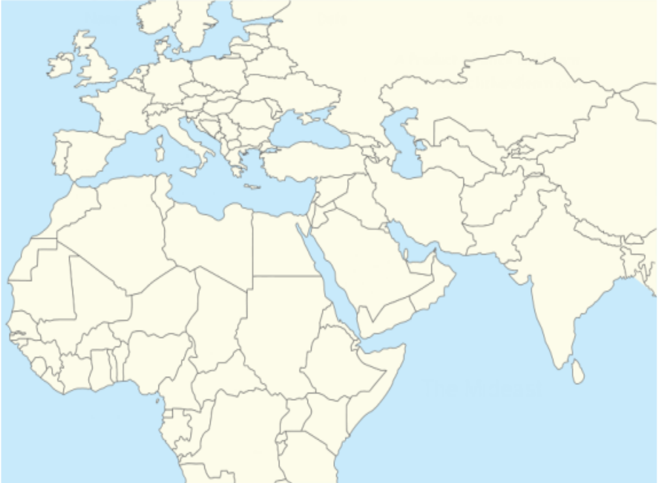
COUNTRY MAP #1