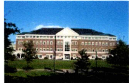
Central State University

Estimate return time Tues. 11/23 10:30 pm