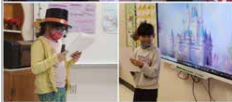
Above: Arcade Elementary students are enjoying an afterschool activity, Reader's Theater.