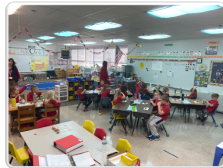
Kindergarten enjoying pumpkin muffins from the October wellness initiative.

Wednesday, November 3 rd , 1:05pm Dismissal Monday, November 15 th , BOE Meeting @ 7:30pm Friday, November 19 th , Mid-Quarter Reports Sent Home Tuesday, November 23 rd , Monthly Assembly Tuesday, November 23 rd , Elementary Early Dismissal for PD Wednesday, November 24 th , No School Thursday, November 25 th , No School Friday, November 26 th , No School Monday, November 29 th , 7:00pm EPAC meeting