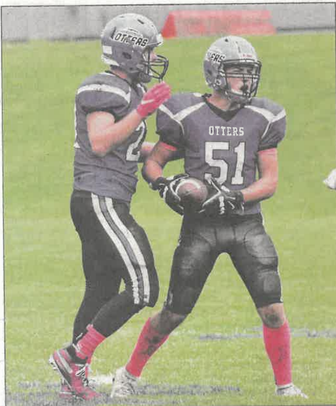
OV #51 IS pumped up after making a key block of a Wasp punt in the fourth quarter to give Otter Valley the ball deep in their own territory

Wasps are scheduled to face (See OV football, Page 17)