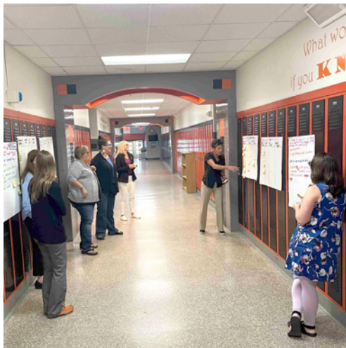
Strategic Plan photos were taken this summer prior to the indoor masking mandate.