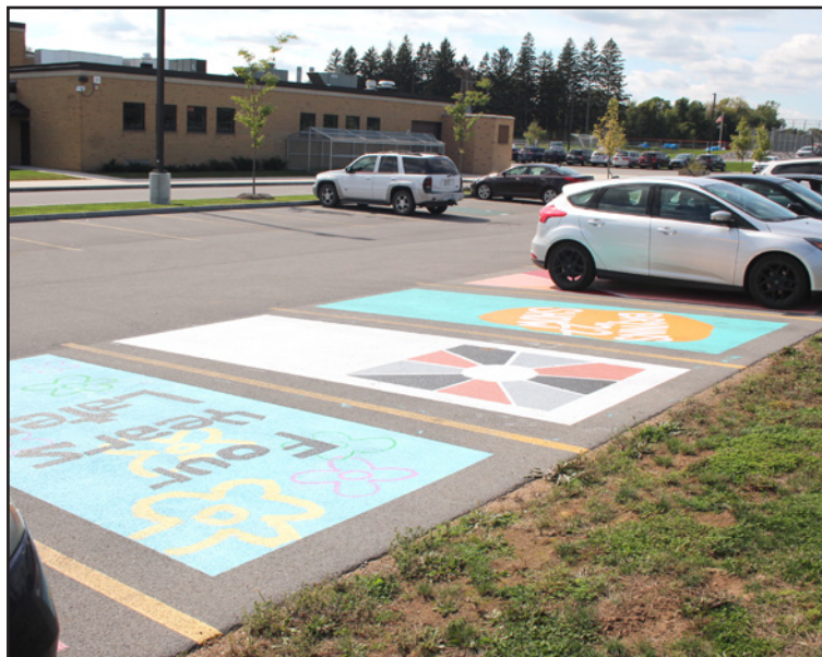
Students decorated their designated parking spots this year with colorful works of art! This project was sponsored by our Student Council.