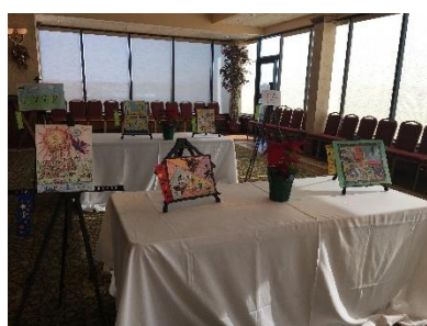
Winning Entries Displayed at the Poster Contest Luncheon