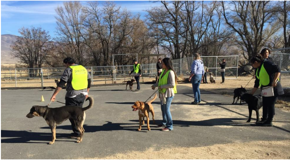
Fall Dog Training class (above) and Spring Dog Training class (below)