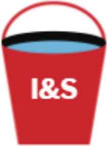
Facility Bond Proposition A