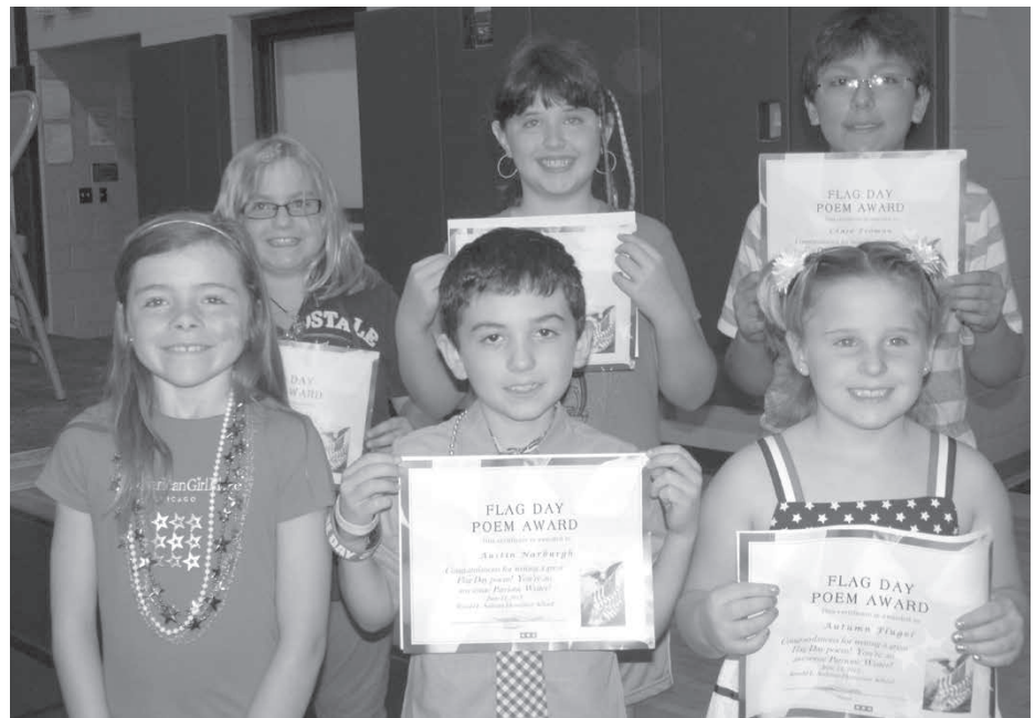
Pictured above Poetry Winners -- (l-r)