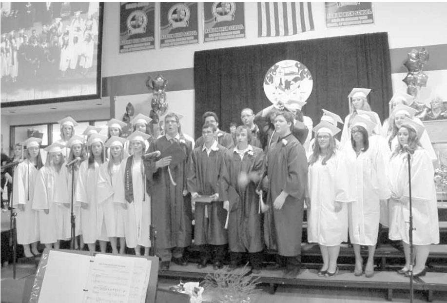
Members of the Senior Chorus sing the National Anthem