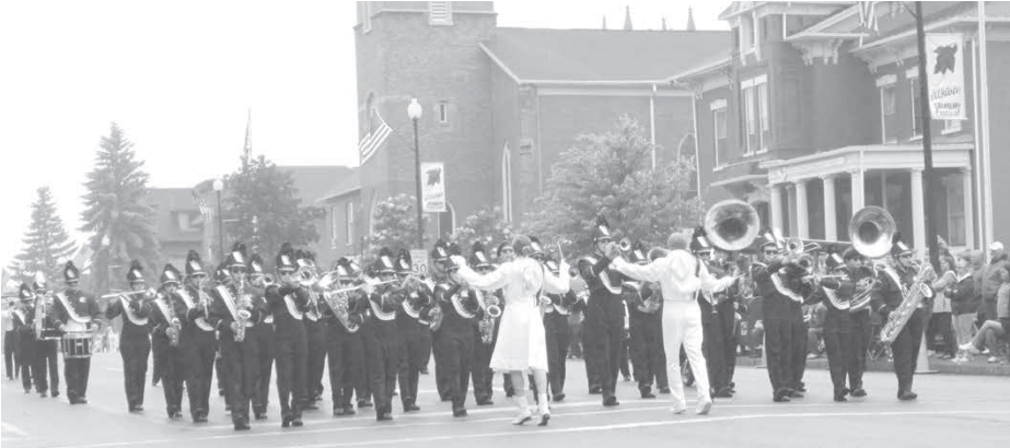
The Albion High School Marching Band performs at the Strawberry Festival Parade.