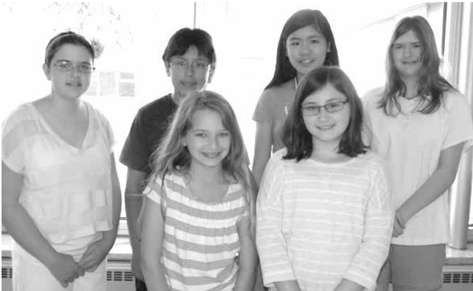
Pictured above —