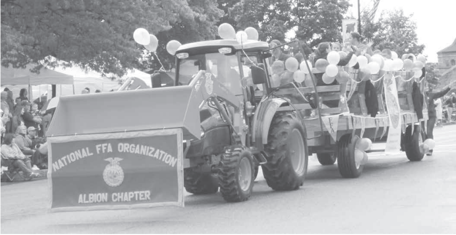
The Albion High School FFA float wraps up a busy year for the Albion Chapter.