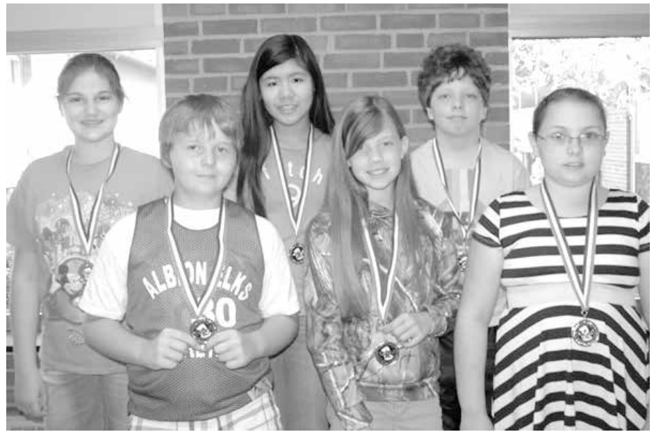
Pictured above (l-r)

The Elementary School prepared to send their 5th grade students to the Middle School during their “Moving Up” Day ceremony. Each student wrote an essay about the things that they had learned at the Elementary School and how it had helped them prepare for the next step in their educational journey. They thanked their teachers and staff members for helping them grow both socially and academically throughout the last six years.