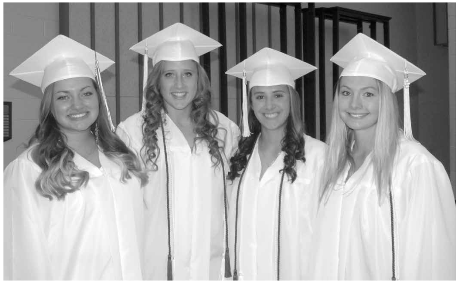
Members of the Class of 2013 gather before graduation.