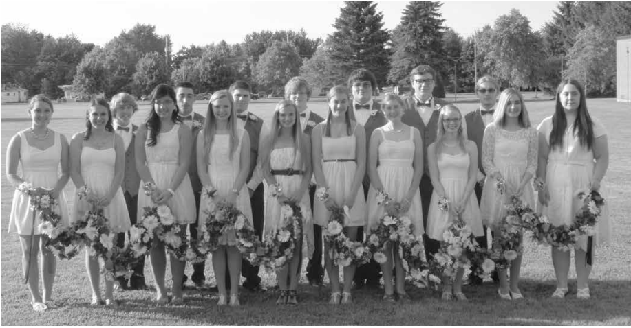
The Daisy Chain