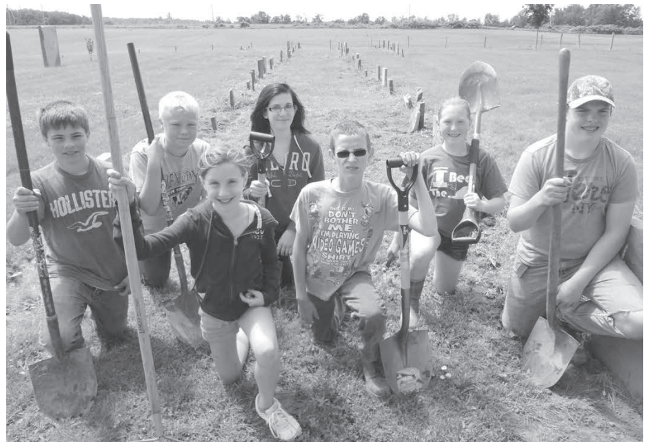
Pictured are (l-r)