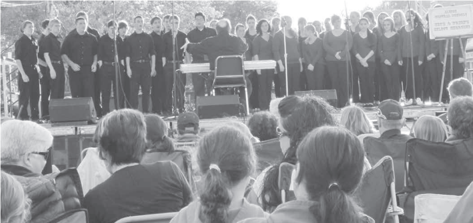
The Albion Men's and Women's Select Choirs performing at "Theatre on Main Street."