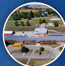
Norway Intermediate 100 School Drive Norway, Iowa 52318