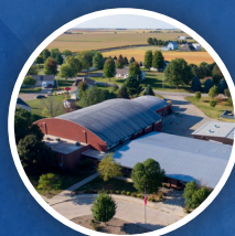
Keystone Elementary 280 4th St. Keystone, Iowa 52249