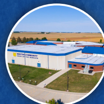
Benton Middle/High 600 1st St. Van Horne, Iowa 52346