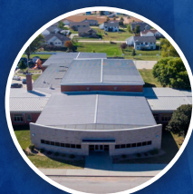
Atkins Elementary 216 4th Avenue Atkins, Iowa 52206

Benton Community staff at the middle and high school levels support students' academic needs in a trusting environment where students feel physically and emotionally safe. Students enjoy a rigorous and relevant curriculum with personal Chromebooks at the high school level.