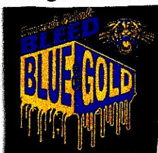
Design A (full front)