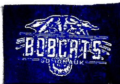
Design B (full front)