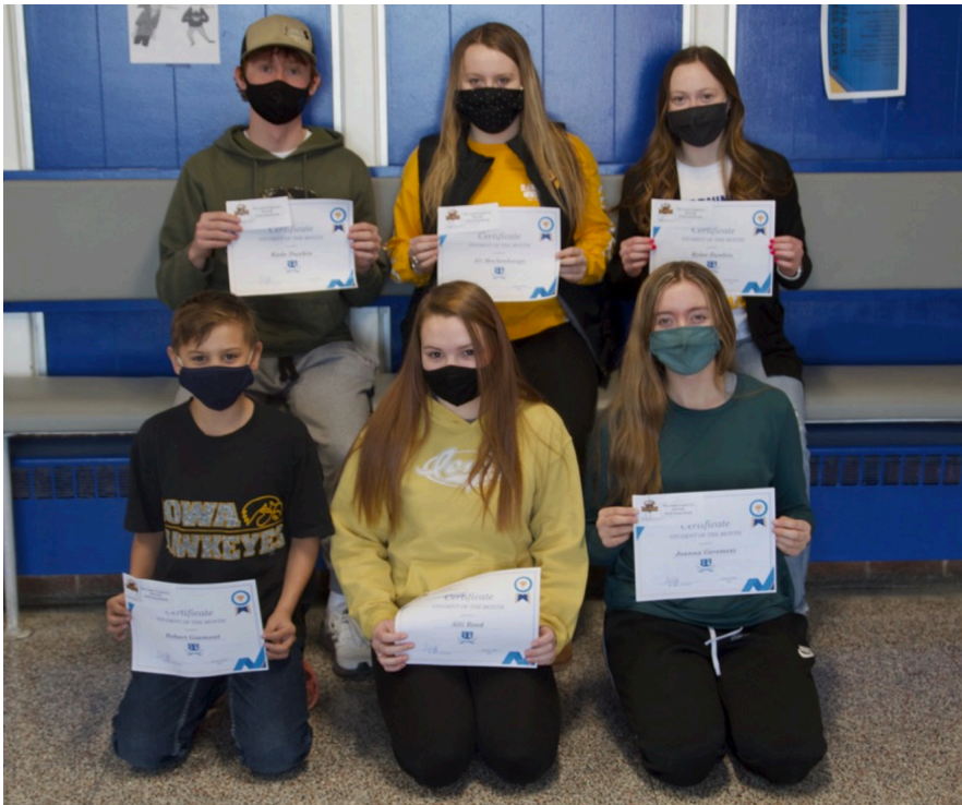
Students of the Month: January