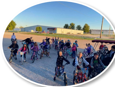
Elementary students recently participated in bike to school day.